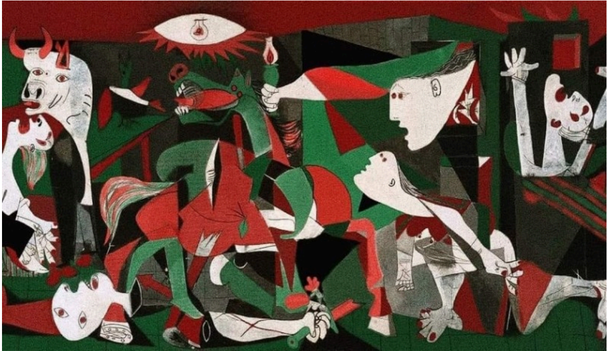
Title image: Guernica, now and then

CONTENT WARNING: this statement contains references of violence, torture, physical and sexual abuse, as well as links to video evidence that is distressing and contains discriminatory language.